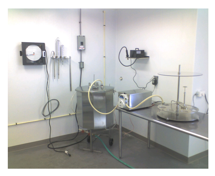
Typical Installation – Pasteurizer with Thermometers and Chart Recorder, Sanitary Tube Pump, Packager. Pasteurizer capacity – 2 to 22 gallons