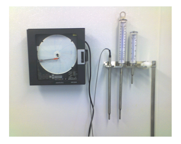
Chart recorder and probe, indicating thermometers