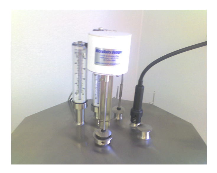
Agitator, Thermometers and Airspace Heater